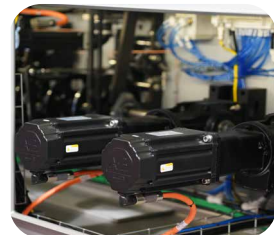
SERVO START STOP SYSTEM