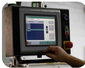
HMI RECIPES SCREEN