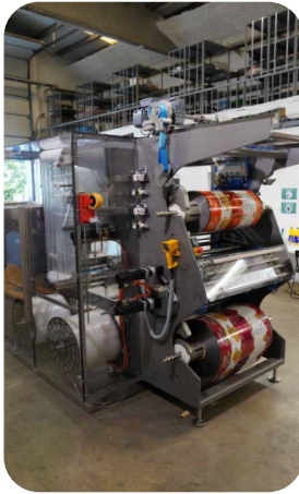
24/7 NON STOP SYSTEM

*Consult warranty terms and conditions with FLTècnics.