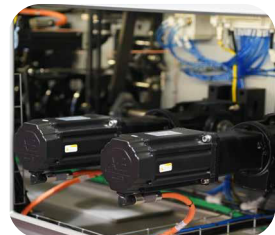
SERVO START STOP SYSTEM